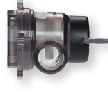
SFI with A-711 option